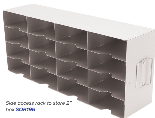
Side access rack to store 2" box SOR196

For front and side access racks for Eppendorf, Panasonic and Thermo freezers please refer to the guide at the back of this catalogue.